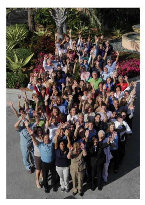
Mariners Hospital staff

question or complaint until they can find someone with the authority or expertise to resolve it.