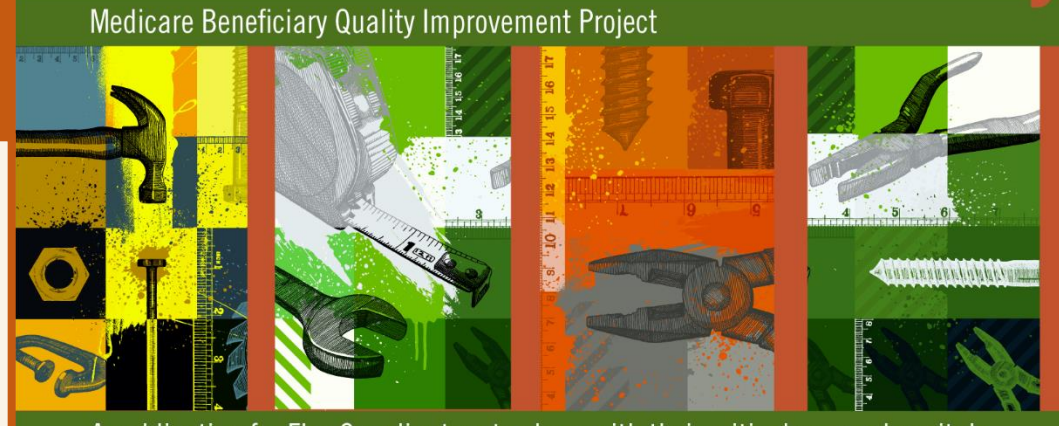
A publication for Flex Coordinators to share with their critical access hospitals

Find past issues of this newsletter and links to other MBQIP resources on TASC's MBQIP Monthly webpage.