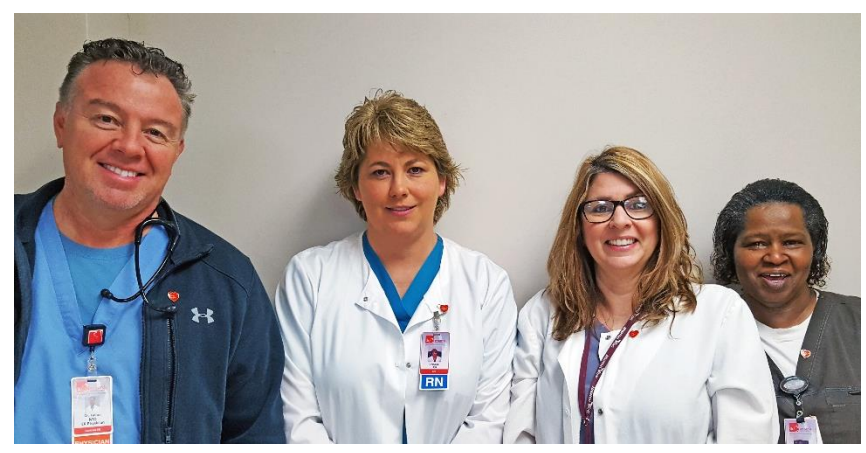
CrossRidge ED staff wearing heart lapel pins for timely AMI care.

potty, positioning and personal space, are documented in the electronic health record (EHR).