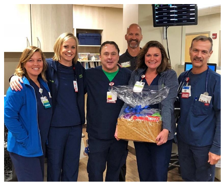
The St. Elizabeth Grant team with a "Caregram" basket they received to recognize their work representing St. Elizabeth Healthcare's I CARE customer service standards (Innovation, Collaboration, Accountability, Respect and Excellence).