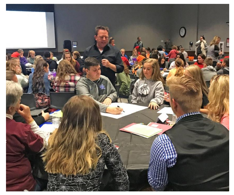
Students participating in the St. Elizabeth Grant-hosted and funded leadership summit for youth.

With regards to infection prevention, St. Elizabeth Grant requires flu shots of all staff and contractors, driving high performance on the healthcare personnel influenza vaccination measure. They also review smoking cessation, pneumonia, and influenza vaccination as part of the admission process on every inpatient. Through their shared electronic health record, hospital staff can tell if patients have received their vaccine at a physician's office within the St. Elizabeth system.