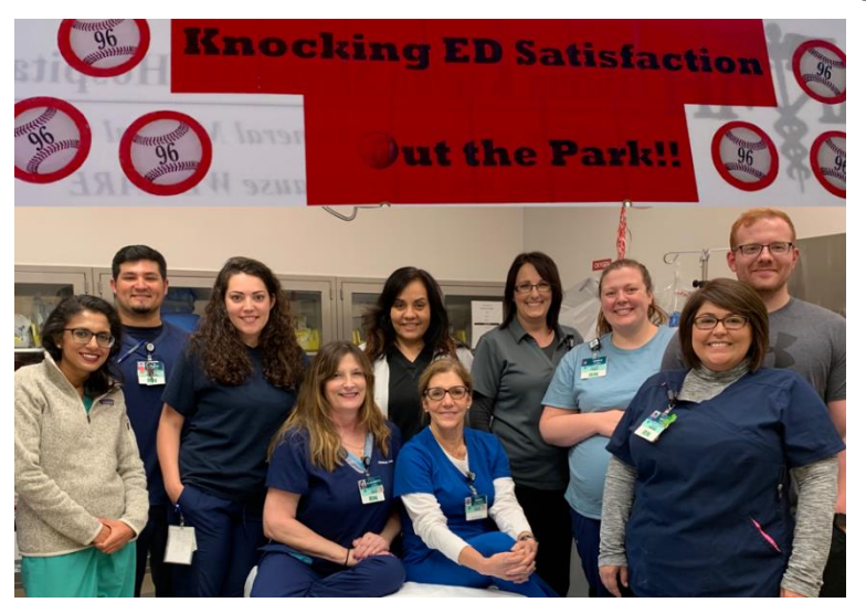
Abrom Kaplan staff celebrate high patient experience scores in the ED.

A different kind of communication board is credited with driving a 100 percent inpatient influenza vaccination rate. Recognizing there was opportunity for improvement, the charge nurses on the floor were made accountable for ensuring all inpatients were offered the flu vaccine before discharge. Tracking was added to the communication board, which is checked each shift. Engagement with the pharmacy and a shared electronic